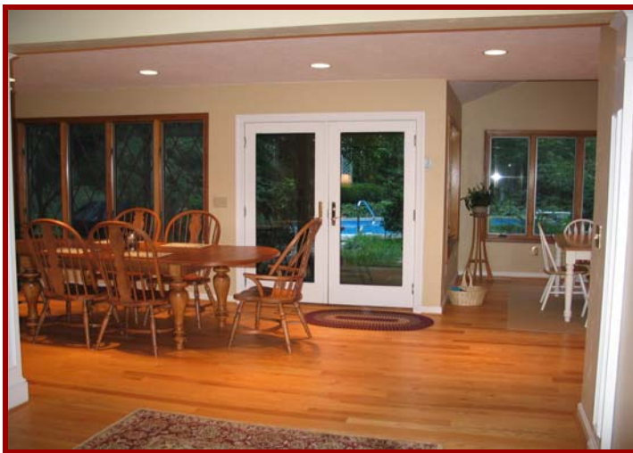
Opened up area revealing new dining room and breakfast nook