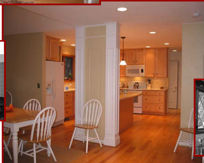
Kitchen is expanded and provides more workable space