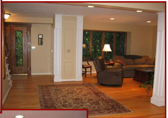
Ornate columns add interest in living room