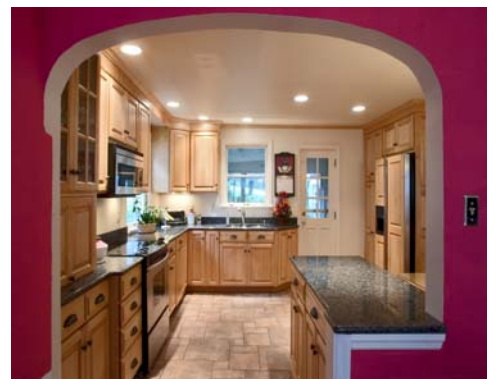
The Ehrhart's kitchen on this year's Spring Remodeling Tour serves as the hub for many family activities.